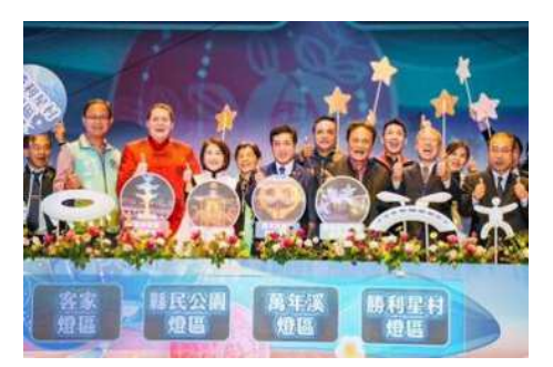
▲ Group photo

●12 January : Visited Pingtung County to review the development of tourist sites ●