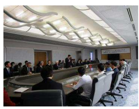
▲ During the ceremony

We hope that the Foreign Skill Interns will continue to excel, that the friendship and trust between Kagoshima Prefecture and the Vietnam National University of Agriculture will deepen, and that agriculture in both Vietnam and Kagoshima will continue to thrive.