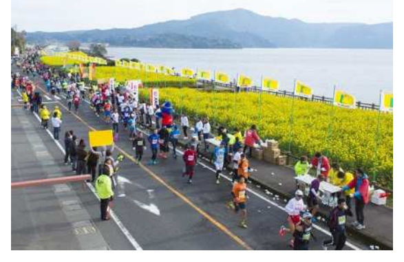
▲ Lake Ikeda and participating runners

The finishing line is right along the shore of Lake Ikeda, offering stunning views of Mt. Kaimon, Lake Ikeda, and the vibrant <u>nanohana</u> flower fields.