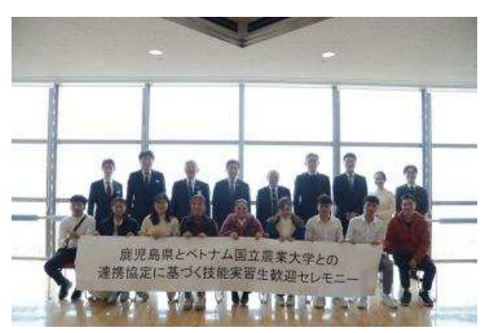
▲Commemorative photo with the Foreign Skill Interns