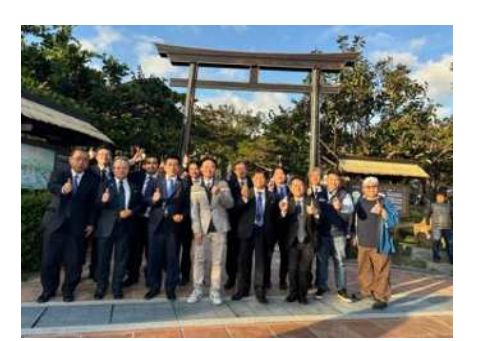
▲ Visiting the Kan Hai Art Museum and Sichongxi Hot Springs Park