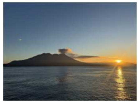
First sunrise from Kinko Bay

Moreover, I became interested in Kagoshima's traditional culture and artifacts. Before coming to Japan, I knew little about Kagoshima, but the longer I lived here, the more I learned about the region—its specialty products, the Kagoshima dialect, and the history of the Meiji Restoration.