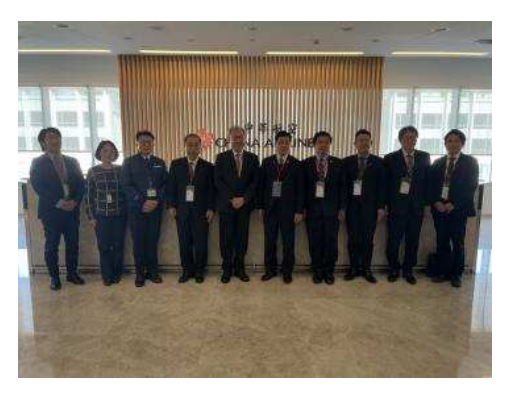
▲ Commemorative photo with China Airlines

●23 January : Held the Welcome Ceremony for Foreign Skill Interns under the Cooperation Agreement between Kagoshima Prefecture and Vietnam National University