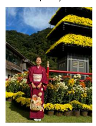
Sengan-en Chrysanthemum Festival

I also had various experiences that deepened my understanding of Japanese culture. One of the most memorable was wearing a