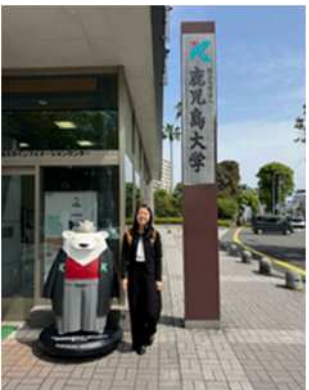
At Kagoshima University

I also visited my grandfather's elementary school, the place where