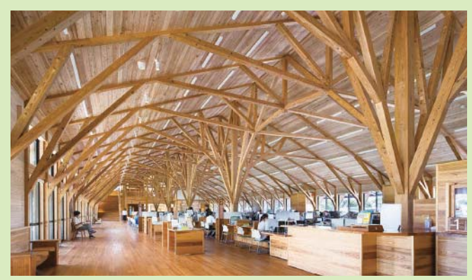
Wooden trusses at reception building of town office

Using Japanese cedar and cypress, it is also possible to design creative, highly fashionable and symbolic buildings. In modern spaces such as this, metal and concrete create a cold atmosphere, but lumber makes for a warm space.