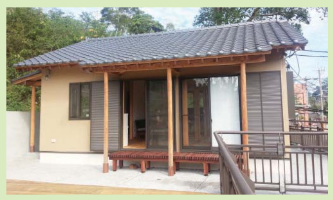
Guest house (small house less than 45 square meters in size)