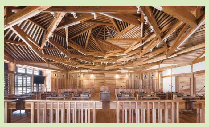
Assembly hall building at town office