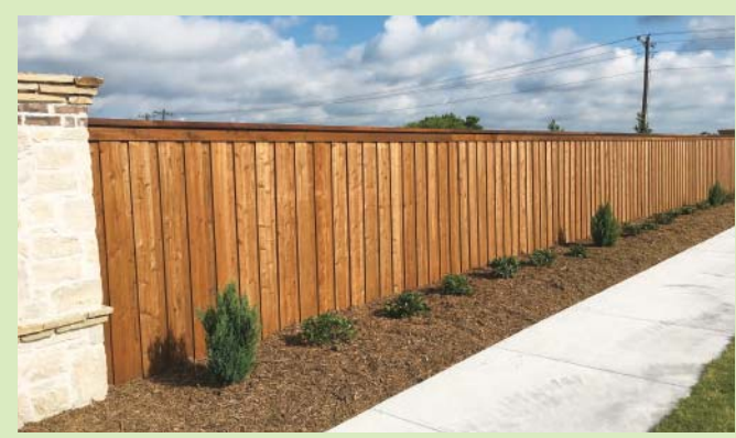
House fence 1

Wood is thought to deteriorate easily, but by applying a chemical treatment, it can hold up to time.