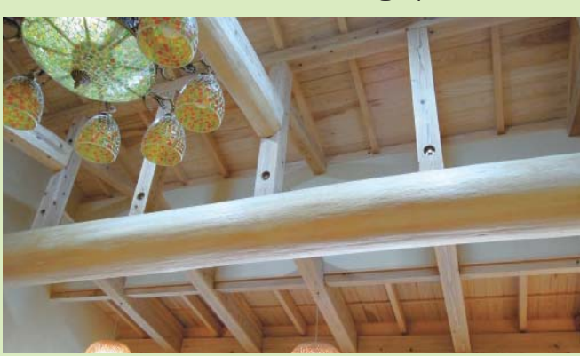
Logs used as beams