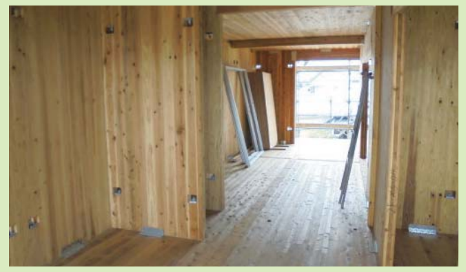
Housing complex (under construction)*CLT panel construction method

CLT is lighter than reinforced concrete and other such materials and can reduce foundation work. On-site construction is also simple, so it helps shorten the work period.