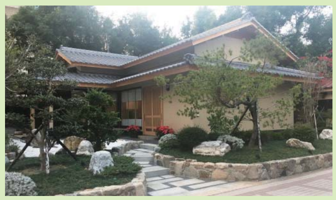
Exterior of house

Japanese-style wooden houses have an open feel and are well-ventilated with excellent humidity control, so they are optimal for hot and humid climates and offer a comfortable living space.