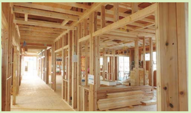
Nursery (under construction) *Dimensional lumber used