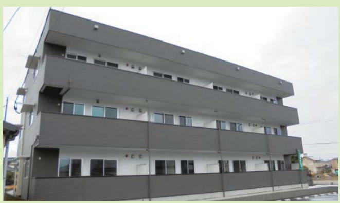
Housing complex (completed)