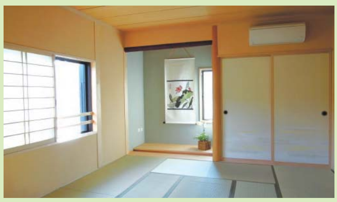
Interior of house