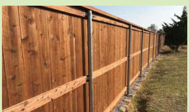
● House fence 2