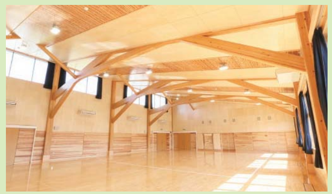
School gymnasium (completed)